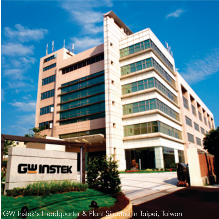
GW Instek's Headquarter & Plant Situated in Taipei, Taiwan

GW Instek has developed a solid brand image and reputation for reliability, integrity and innovation